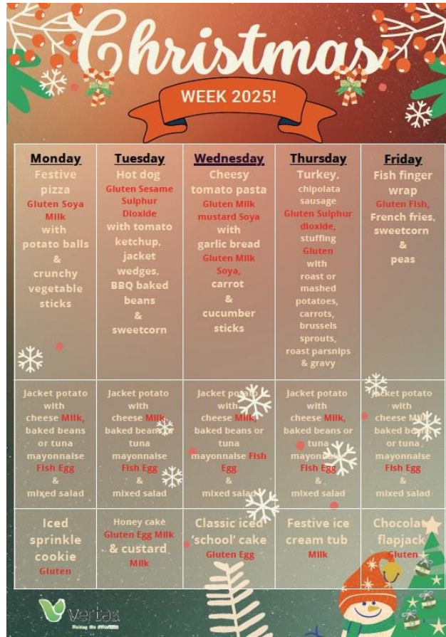
Christmas Week Menu for week beginning 8 December.